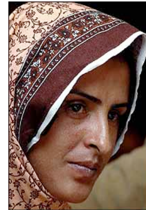
Mukhtaran Mai Women rights activist